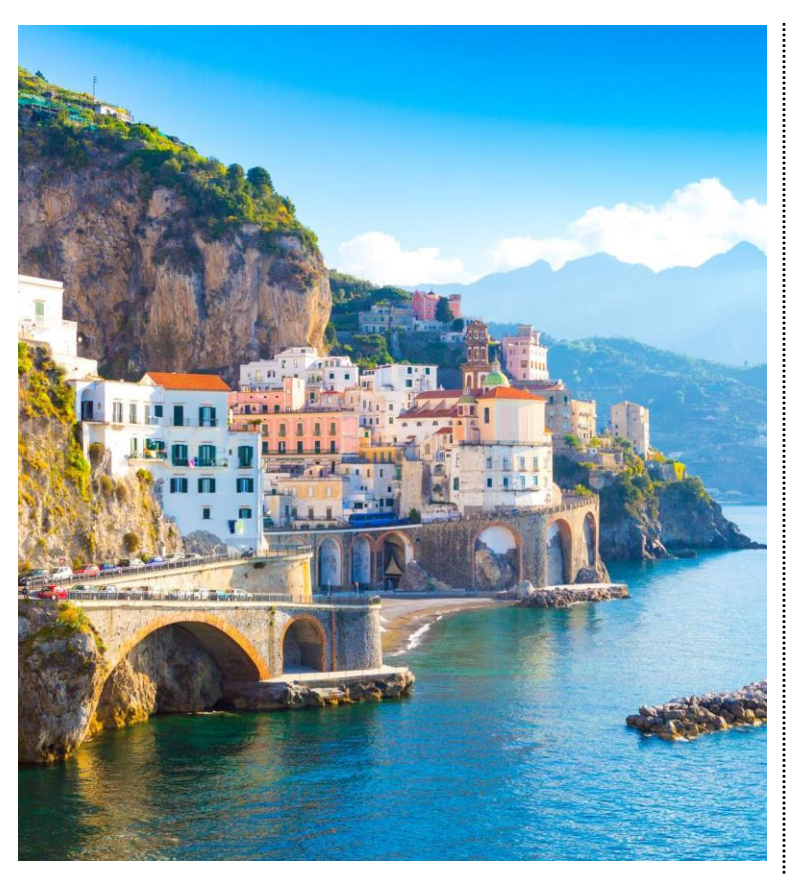
13 Days • 17 Meals: 11 Breakfasts, 2 Lunches, 4 Dinners

HIGHLIGHTS... Rome, Colosseum, Ruins of Pompeii, Choice on Tour: Iconic Pompeii Walking Tour or Leisurely Pompeii Walking Tour, Sorrento, Florence, Leaning Tower of Pisa, Tuscan Winery, Venice, Murano Island, Verona, Lake Maggiore, Stresa, Choice on Tour: Isola Bella & Palazzo Borromeo Tour or Simplon Pass Day Trip