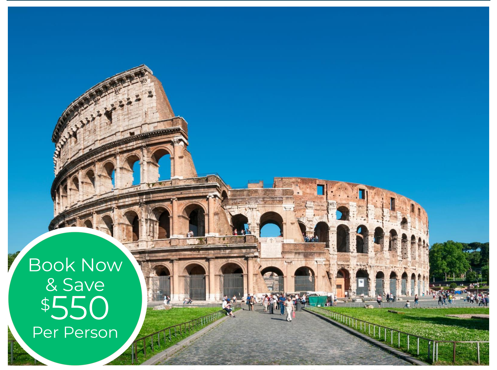
Upgrade to Elite Airfare! See inside for details.